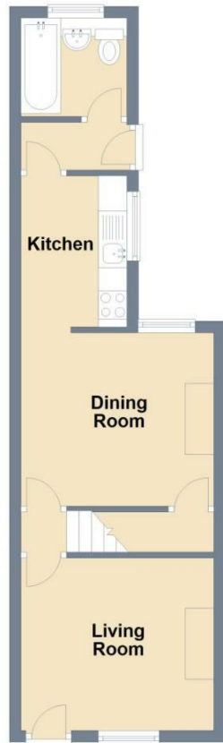
Ground Floor Approx. 34.0 sq. metres (366.0 sq. feet)